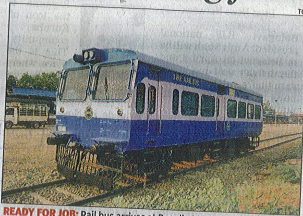
READY FOR JOB: Rail bus arrives at Bagalkot town on Thursday to commence its service to Khadjidoni village

This is said to be first time the rail bus service is starting on the newly constructed railway line between Bagalkot and Kudachi, which is yet to be completed. This service is run in segments where passengers are few, usually in hilly areas. Instead of running a train of more than 20 bogies, this small rail bus carrying few passengers, is feasible for the department.