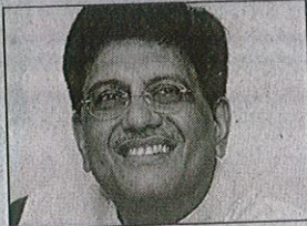
TO BETTER FACE EXAM

"In his unique style, PM Modi has simplified complex issues into 25 simple mantras. The book helps students gain self-confidence and tea-