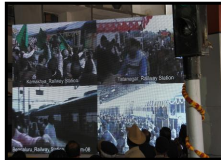
Inauguration of Yesvantpur –Tatanagar Weekly Express