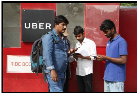
App Based Taxi Service at Yesvantpur, facilitates passengers with enhanced last mile connectivity