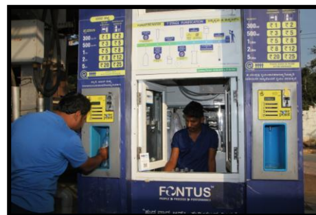
Water Vending Machines Yesvantpur station (10 Nos.)