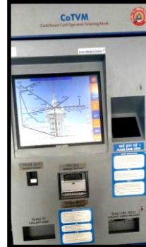
Cash cum Coin operated Ticket vending Machines - Yesvantpur (3 Nos.)