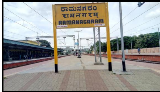
Doubling with Electrification KSR Bengaluru - Mysuru