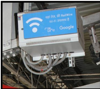
Wi-Fi – A step towards Digital India Yesvantpur station