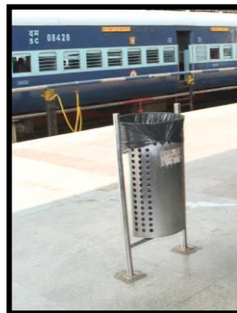
Stainless Steel Litter Bins Yesvantpur (20 Nos.)