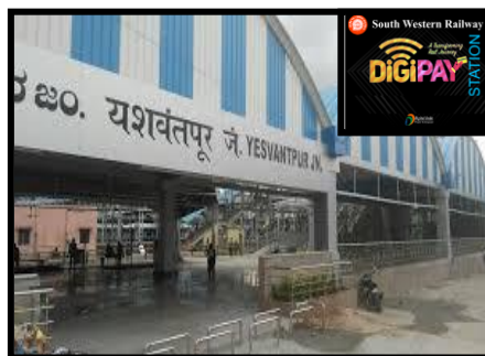
Digi-Pay enabled station – Yesvantpur, facilitates digital payments for transactions at passenger interface areas