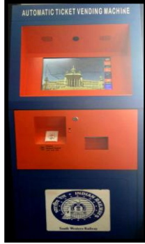
Automatic Ticket Vending Machines Yesvantpur (7 Nos.)