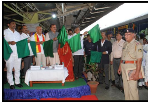
Flagging off DEMU Services between Yesvantpur - Nelamangala & Yesvantpur - Hosur